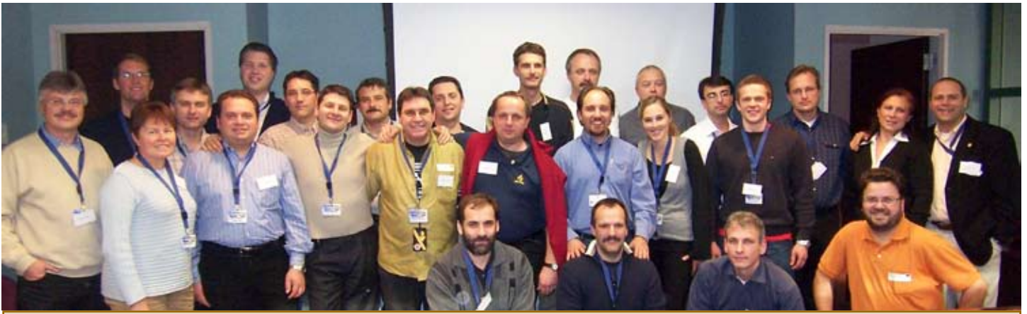
Group Picture of EUD Youth Directors

caring for children in these dangerous suburbs! Saturday: we attended the program for the earliteens, in which there were more than 800! The program was shaped entirely for this age group. Afterwards we rode on different buses and went to pick up children directly from their homes to attend the second service that gathered children ages 4-6. Can you imagine 700 children participating in a one hour spiritual program without parents?! I let the organizers borrow my angels for that day (smiling); they needed them more than me! I can easily say to all of you: I will never forget the experience I had in Metro Ministry. The eyes of thousands of children that crossed mine, left in me a deep mark. Sunday December 3 was the day of departure. We waved each other good-bye and declared this wonderful adventure "finito".